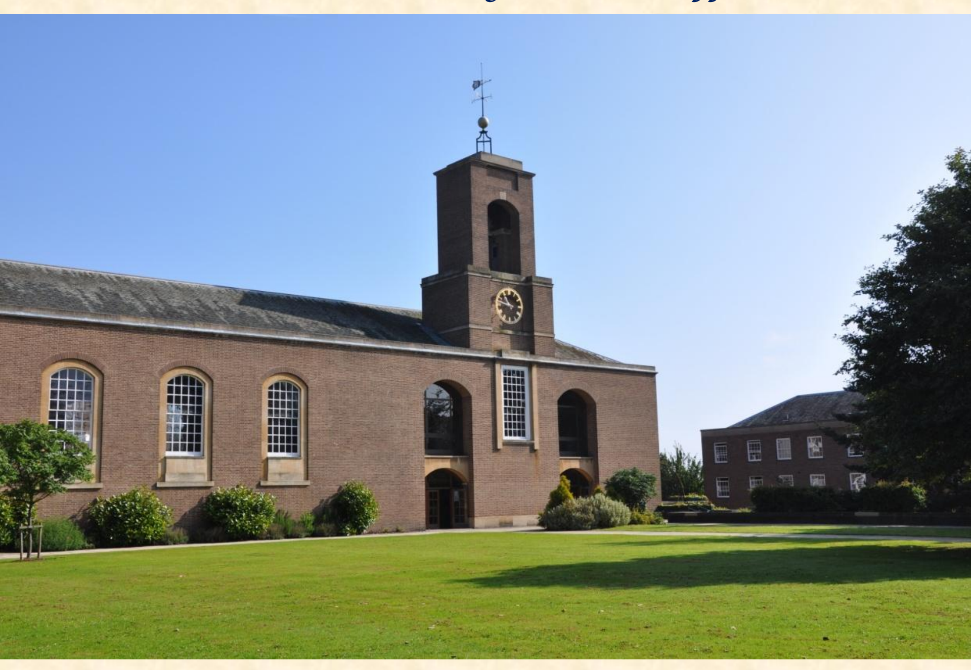
The Clock House Building where it all happened.