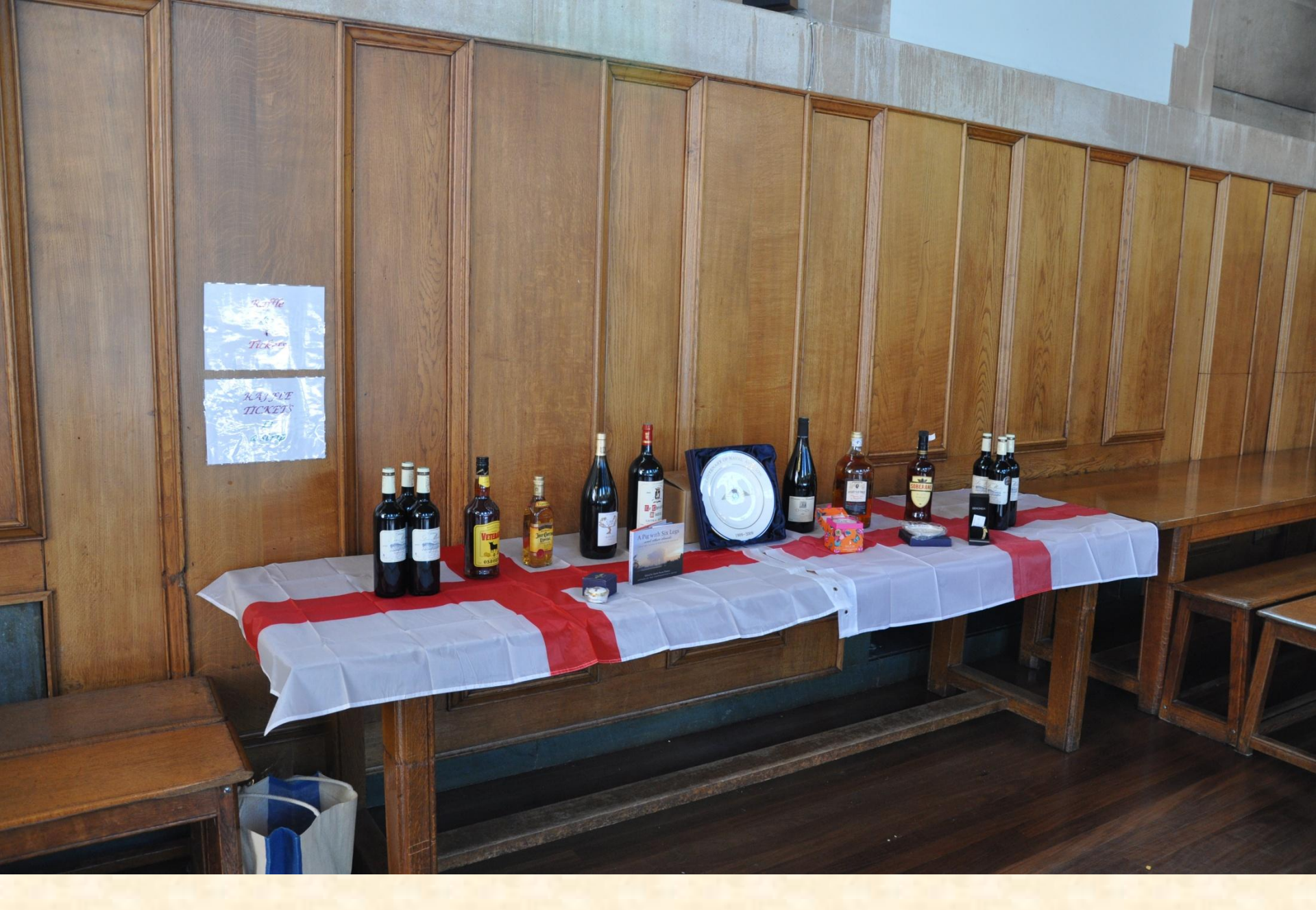
All set up in readiness.