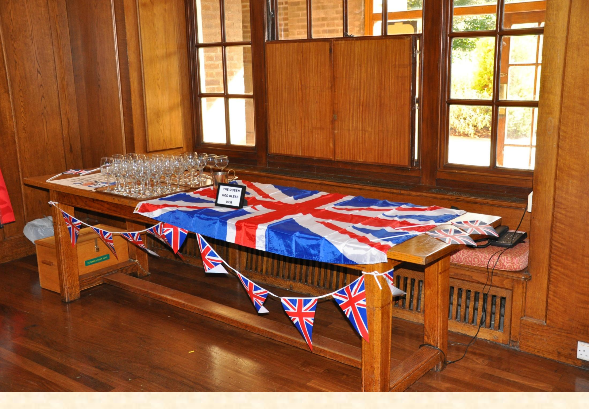
All it needs now is the Rum Barrel!