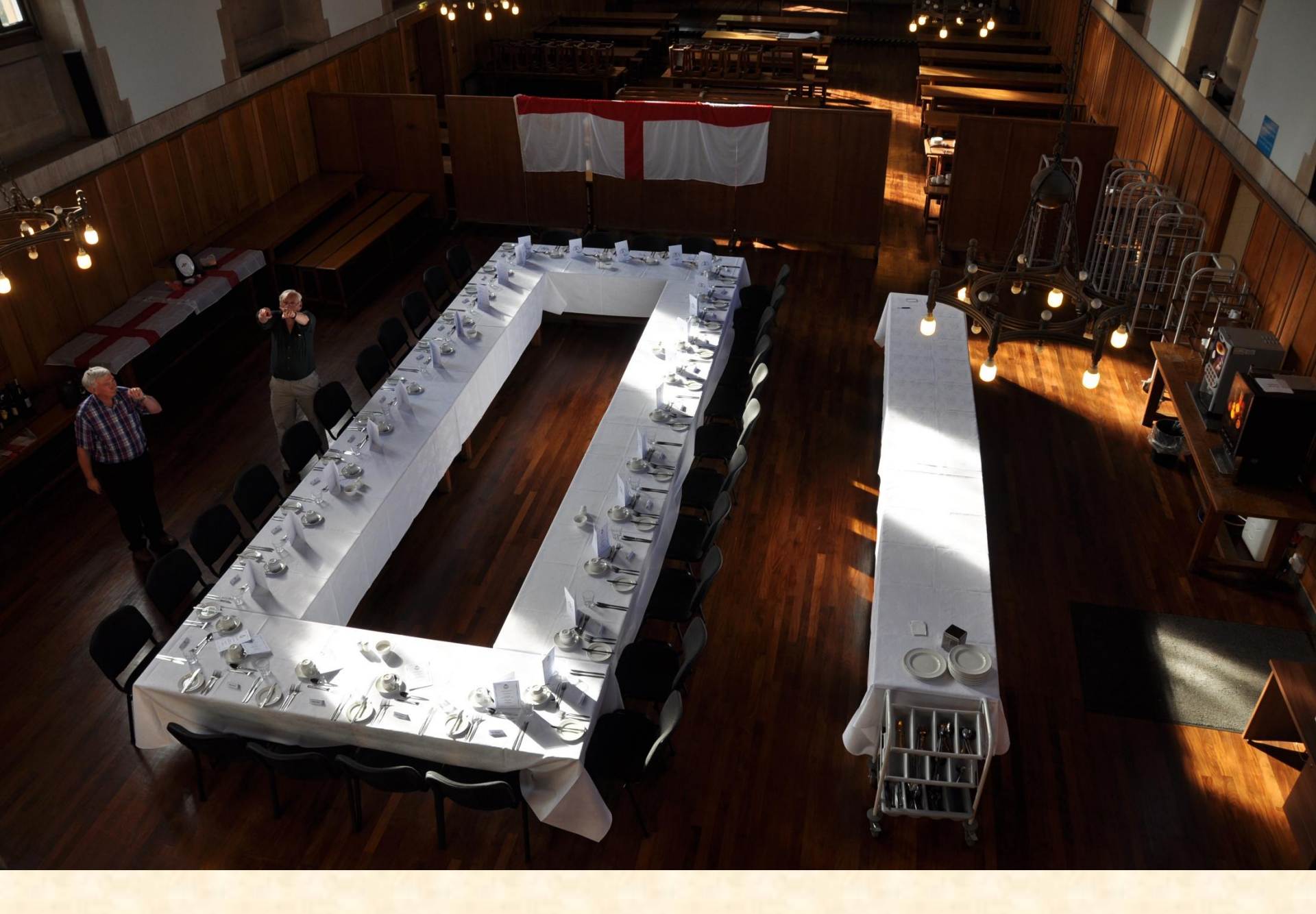
Arthur indicating as to where the White Ensign should go.