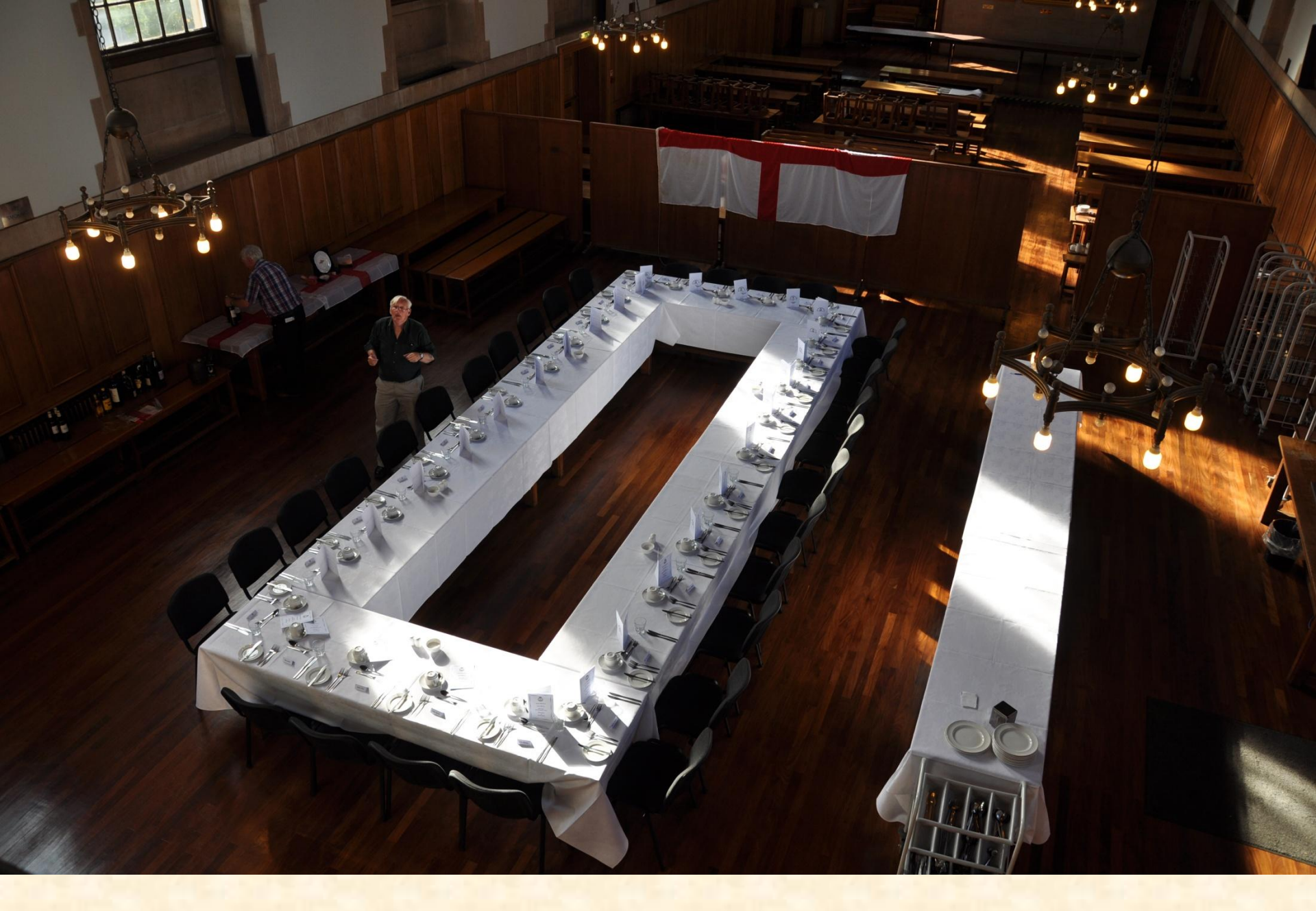
Table set out in readiness for the evening function.