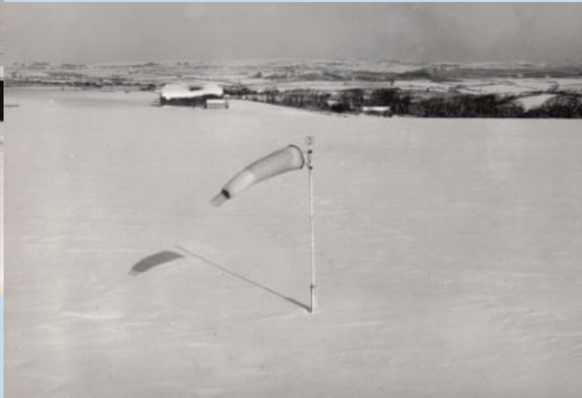
Culdrose Windsock 1954 Jan 31 st .