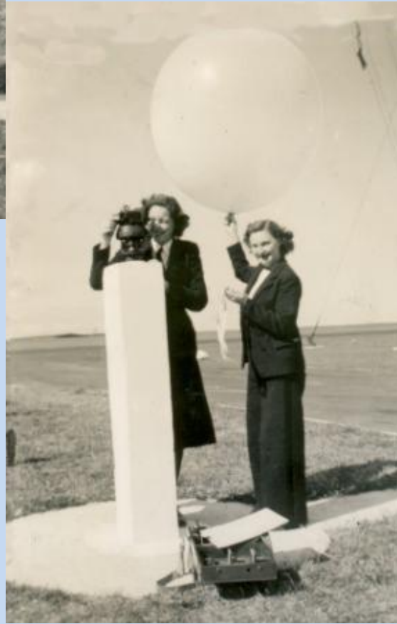
Releasing the 1,000 footer Pat & Pat 1948.