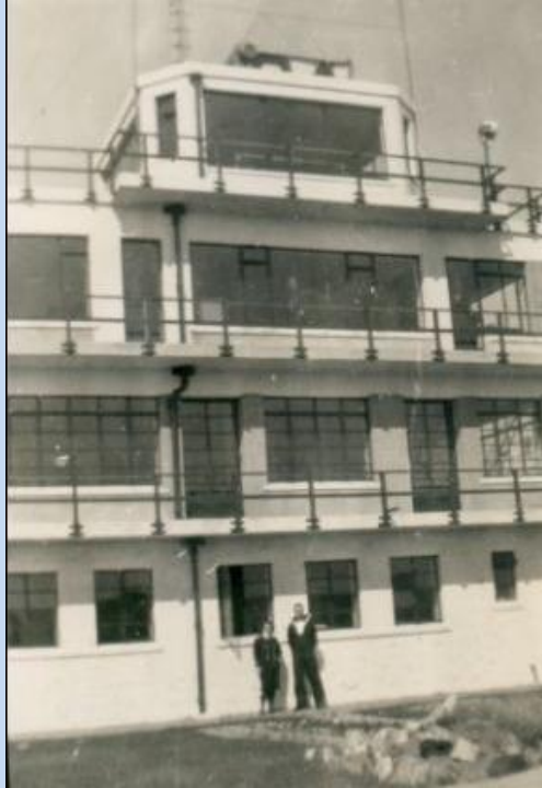
The Control Tower RNAS St. Merryn 1947.