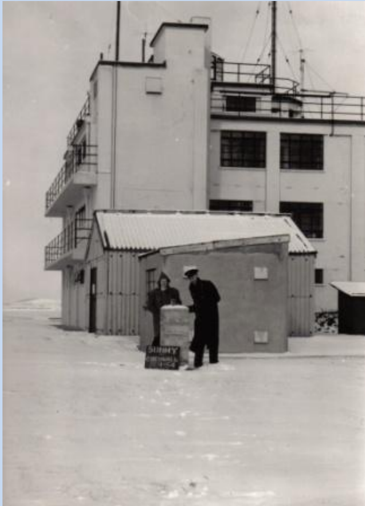
Culdrose 1954 Jan 31 st .