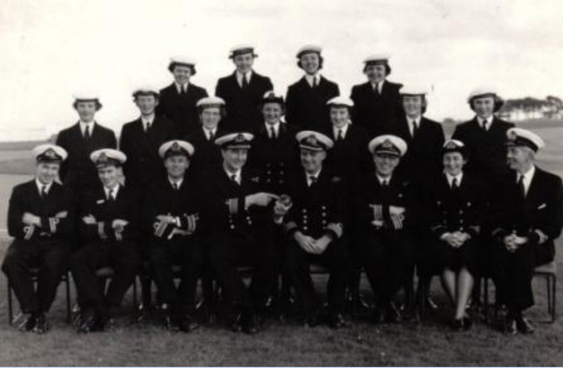
Met Staff Culdrose.