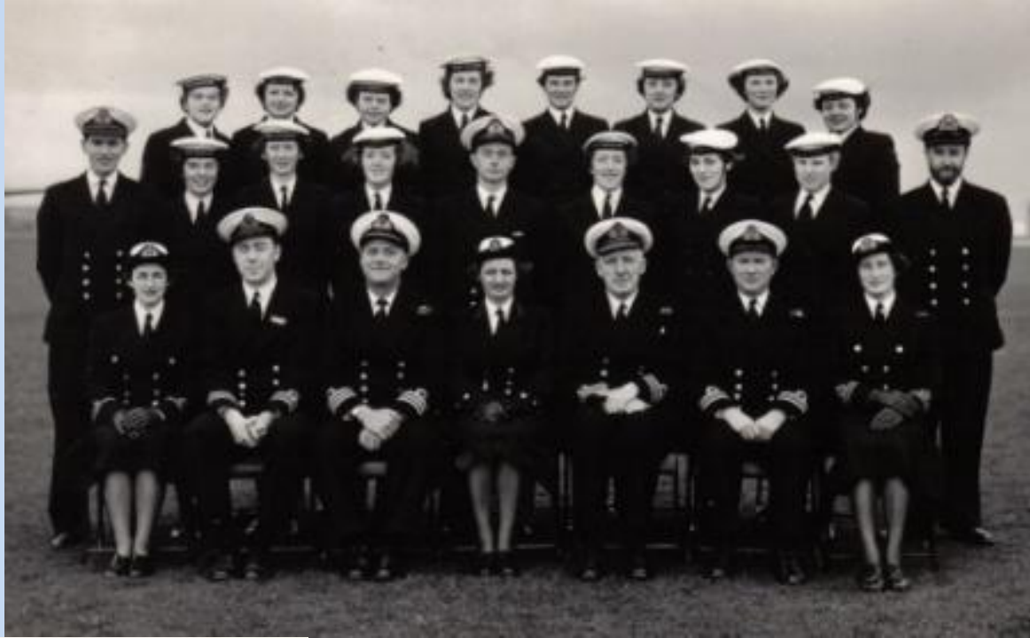
HMS Seahawk, March 1959.