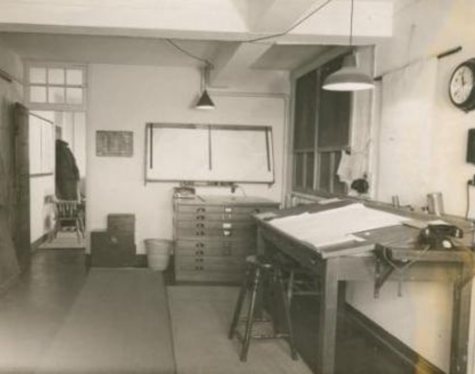
Wartime Met Office, Yeovilton.