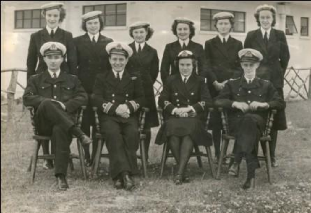
Met Office Personnel, Culdrose