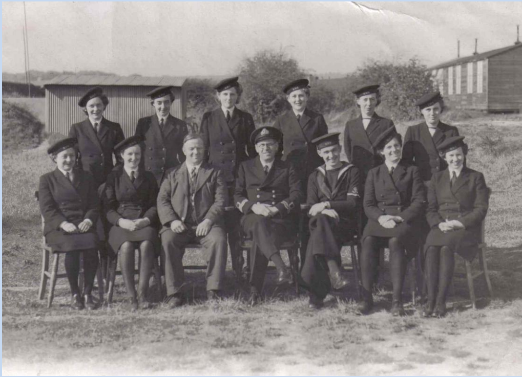
HMS Kestrel Met Staff, 1943. (Not necessarily in order as shown in picture)