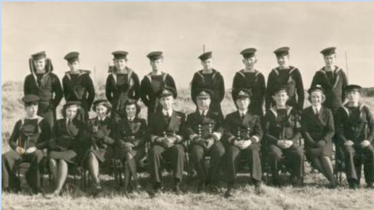
A selection of group photos.