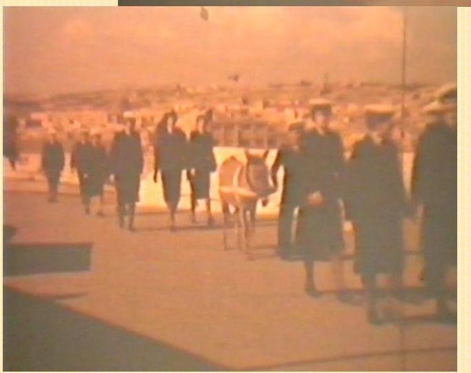
'Manuella' the mascot of the island's naval supply with some Wrens!