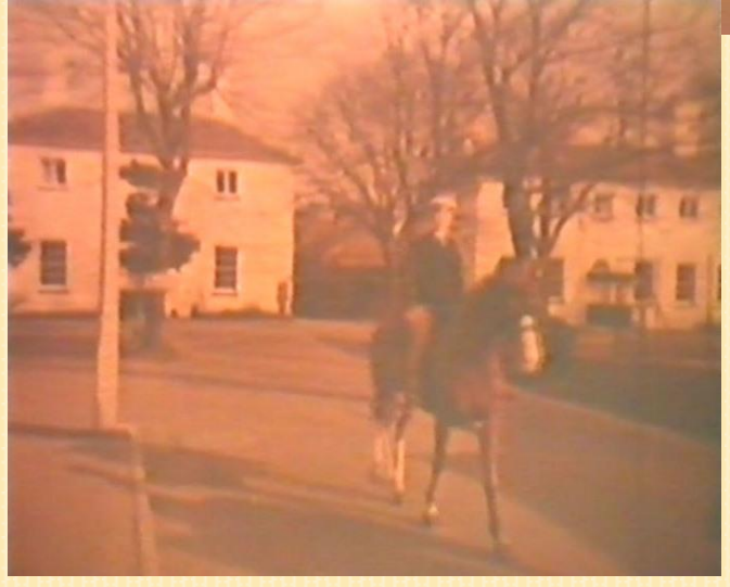
...who are off duty!