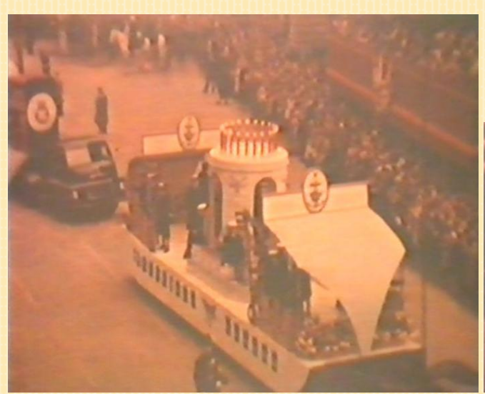
In 1960 the Wrens celebrated their 21st birthday!