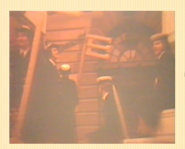
They enter a float in the Lord Mayor's show to celebrate!