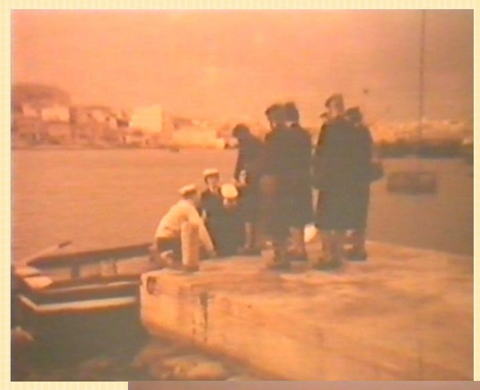
A boat trip round the harbour!