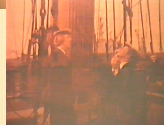
Off duty and paying a visit to Nelson's Ship HMS Victory!