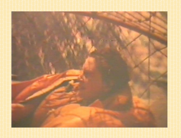
Teaching air-crew safety equipment drill!