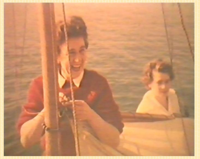
Plenty of opportunity for sailing!