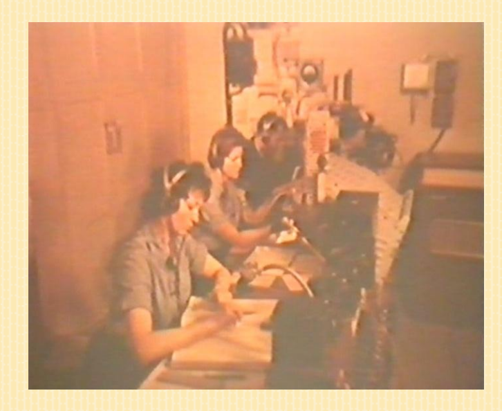
Wrens plotting a pilotless plane's progress - naval pilot sitting with them flies it by radio!