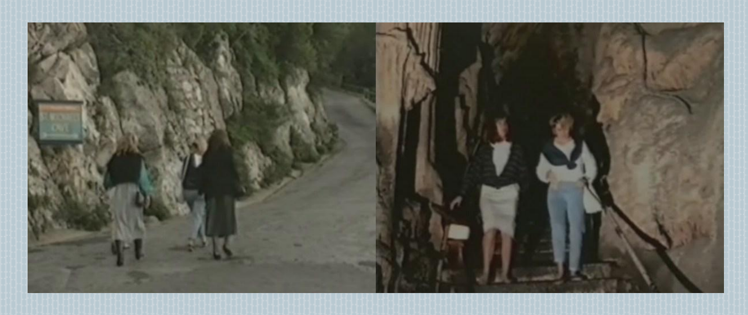
Explore the sites!