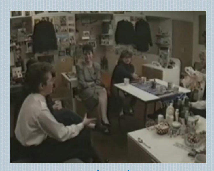
... meeting 'new' friends' when you move to a new base!