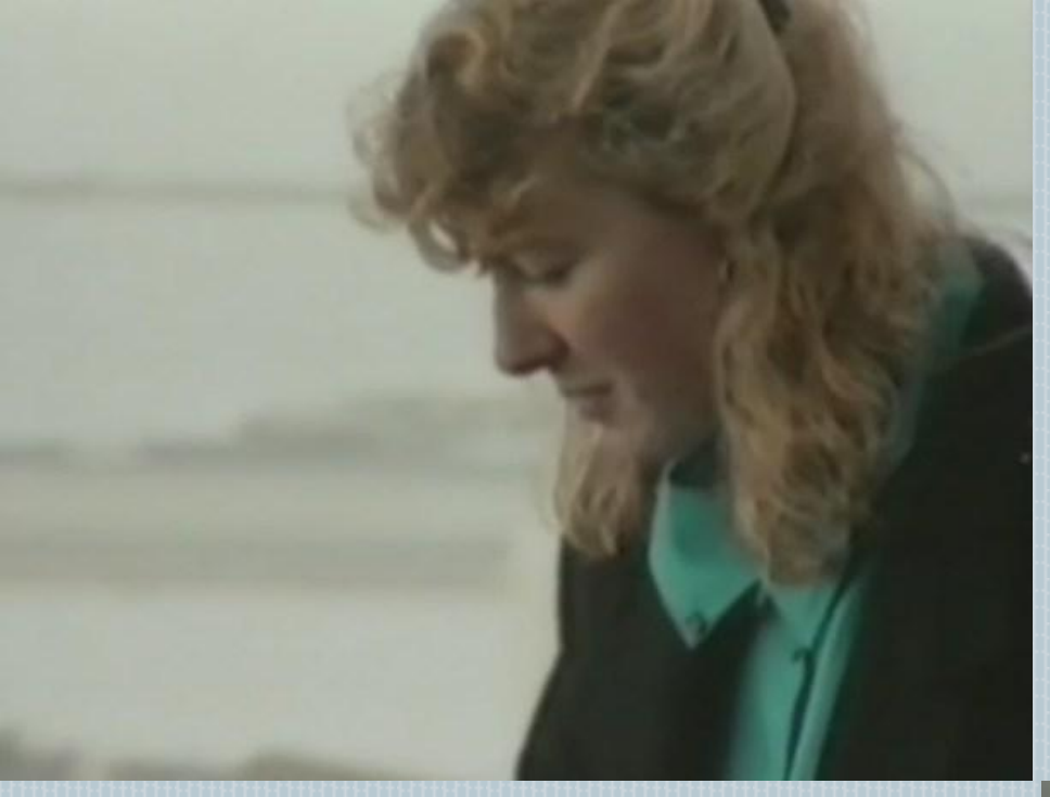
Meet the natives!