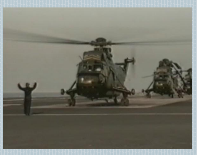
S.A.R. are scrambled!